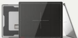
Rayence DR Panels