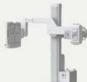
Rayence RU-3000 Series